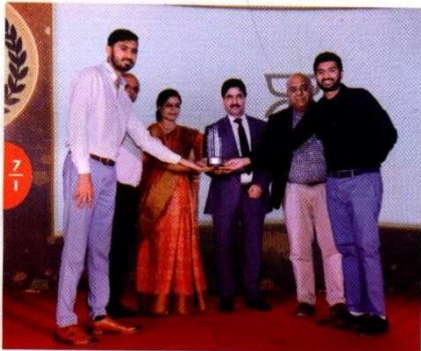
7 Iconic Project of the Year - Pramukh Group for Pramukh Greens & Raama Group for Raama Eternia