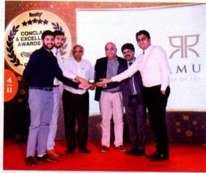
4 Mid-Segment Project of the Year - Sangini Group for Sangini Gardenia & Pramukh Group for Pramukh Aranya