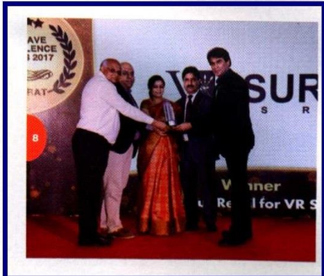
9 Design Project of the Year - Arvind Smart Spaces for Arvind Uplands